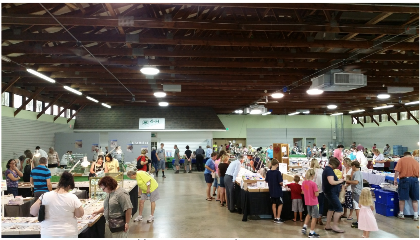
North end of Show. Vendors, Kids Corner, and demonstrators!!