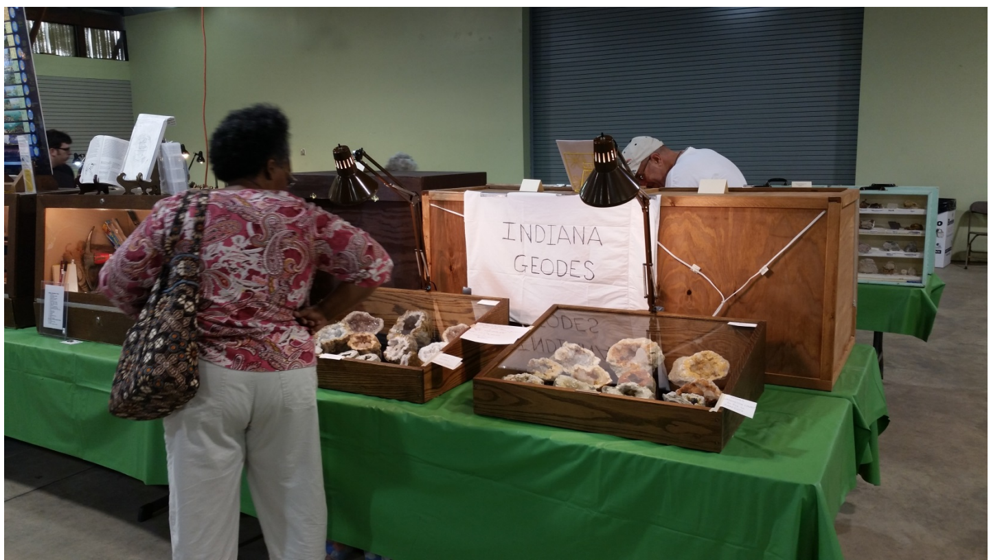
Checking out the Displays