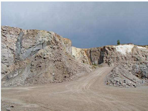
Photo of quarry

Kentland is world famous as the only active quarry that is also an impact site. You will have the opportunity to collect shattercones, as well as calcite, coesite (impact quartz), dolomite, marcasite, and stishovite (another high pressure impact quartz)