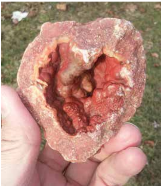
Geology Valentine Rock &