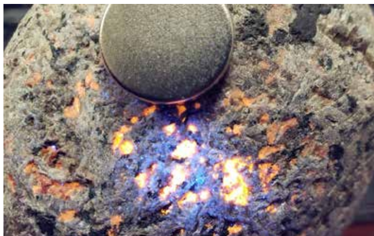
Fairly bright UV response even in normal household lights!