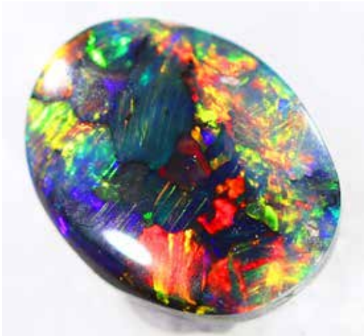
Opal in October