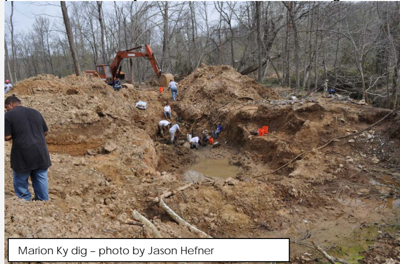
Marion Ky dig

If we are able to get into a quarry this year the class is a must so, please make sure you attend the march meeting.