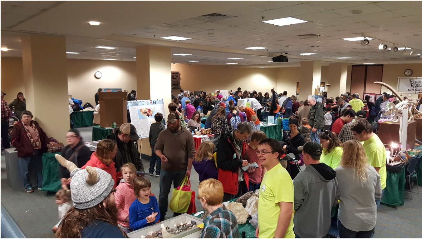
Crowds throughout the day kept our members busy.