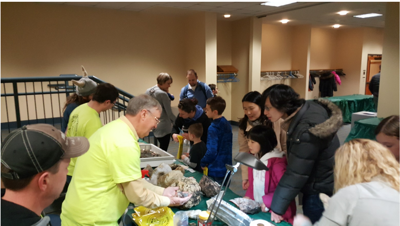
Demonstrating how water changes the color of specimens.