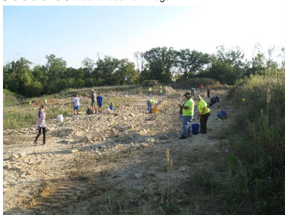
The Borrow Pit