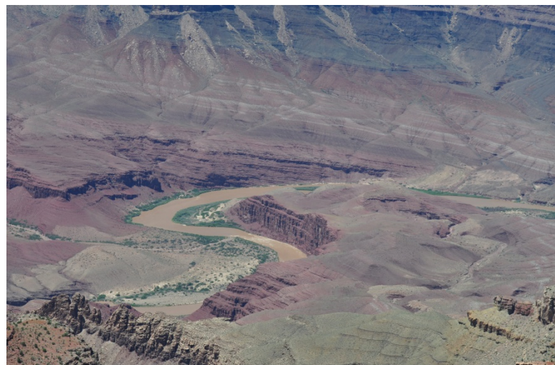
The mighty Colorado river

What an incredible trip and everyone liked "all that geology stuff" I kept talking about.