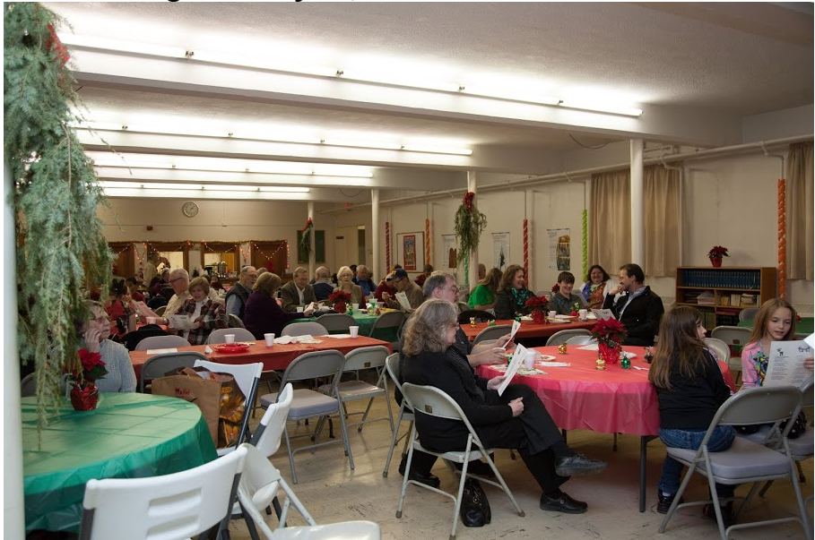
The Christmas Party