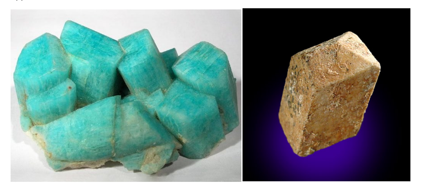
Amazonite

We usually have some time at the end to look at some unknown you might need help on (no promises of a positive ID, but we are getting better at identifying minerals). Our unknown this month was pyrophyllite. Everyone went home with a specimen of Kimberlite from Lake Ellen, MI, this month. Hope you can join us for the next meeting and let part of your collection get to meet some other rockhounds and be appreciated.