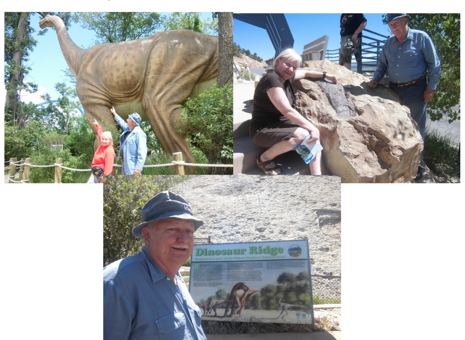
The Rockfinder June 2014 Page 8 of 8

Our next stop in our quest to find a dinosaur found us at Dinosaur Ridge which is located outside of Denver, Co. near Red Rocks. Stegosaurus, Colorado's State Fossil, was first discovered there in 1877. Some of the bones can still be seen imbedded in the sandstone there today. After browsing in the Visitor Center, which included many very reasonably priced rocks and minerals, we took the bus tour up the mountain. The driver was very informative and the stops to see and touch dinosaur tracks, footprints, and bones were great. Most interesting was the Dinosaur Tracksite. This mountainside excavation, approximately 50' x20', contains over 300 footprints left by several different dinosaurs. One gets the Impression that almost anywhere on this ridge more footprints could be discovered. But, alas, we found no live dinosaurs here either. Our quest to find a dinosaur this summer had failed. It turns out that we were about 100 million years too late, but we did have lots of fun!