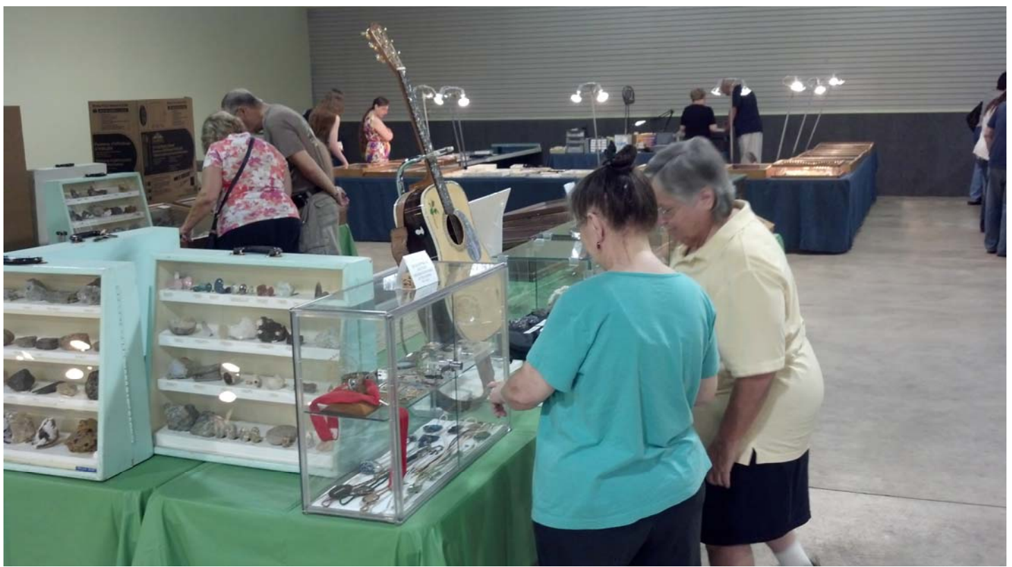
Browsing the displays – learning can be fun!