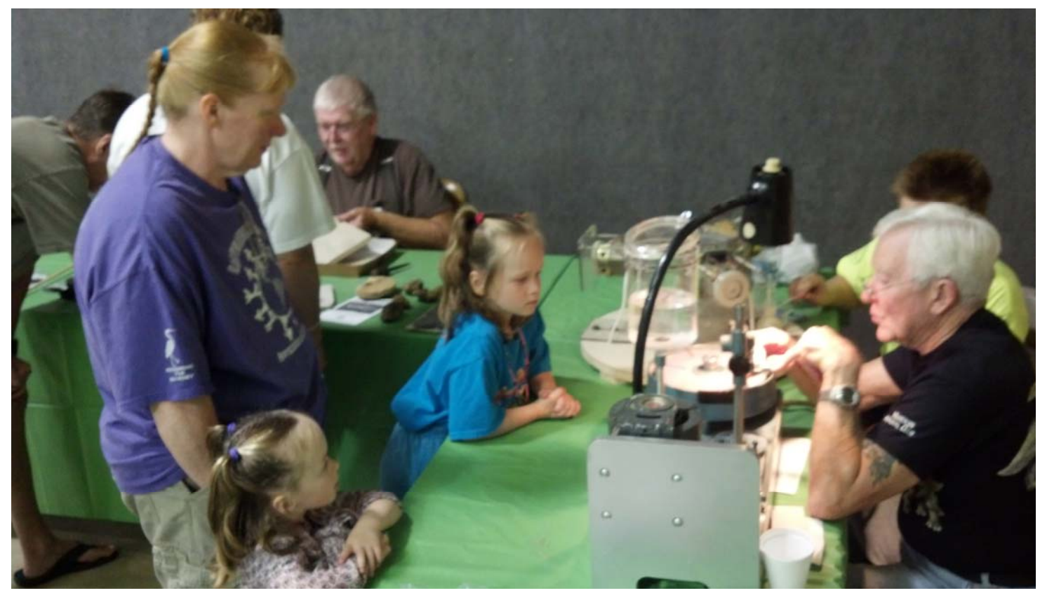
Watching and learning at the demonstrators area.