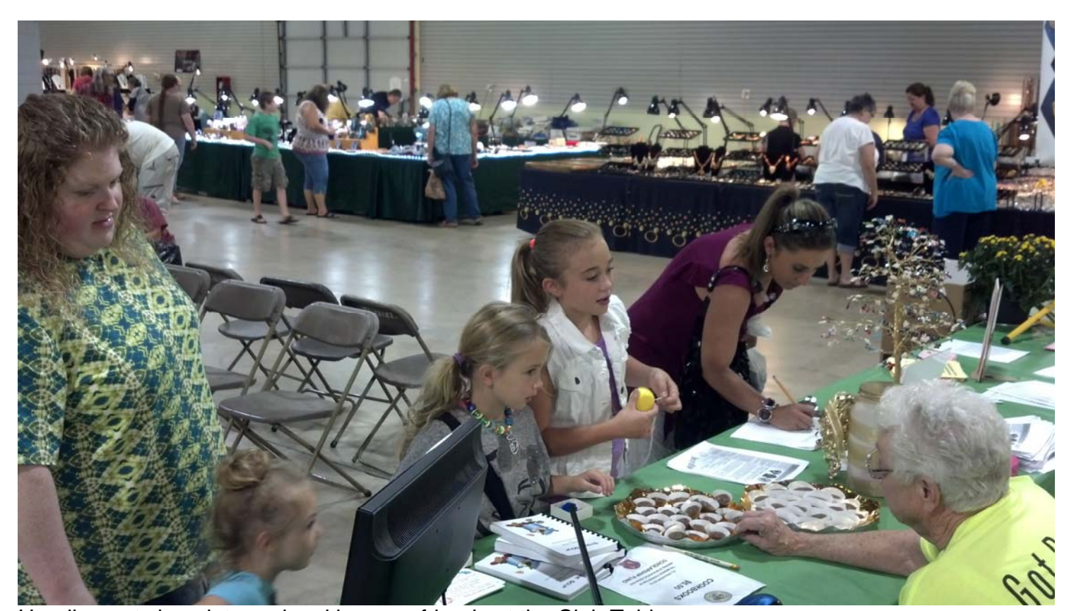
Handing out chocolate and making new friends at the Club Table.

I think we had a Great Show. I was there weird hours due to scheduling conflicts, but it seemed we had great attendance and the dealers I spoke with were happy. We had over 40 people (or families) express interest in joining our club so let's see how much we can grow! Below are some pictures I was able to snap at the show. I don't have the final tallies on number of people, monies made, etc so to get that come to the September 22<sup>nd</sup> meeting.