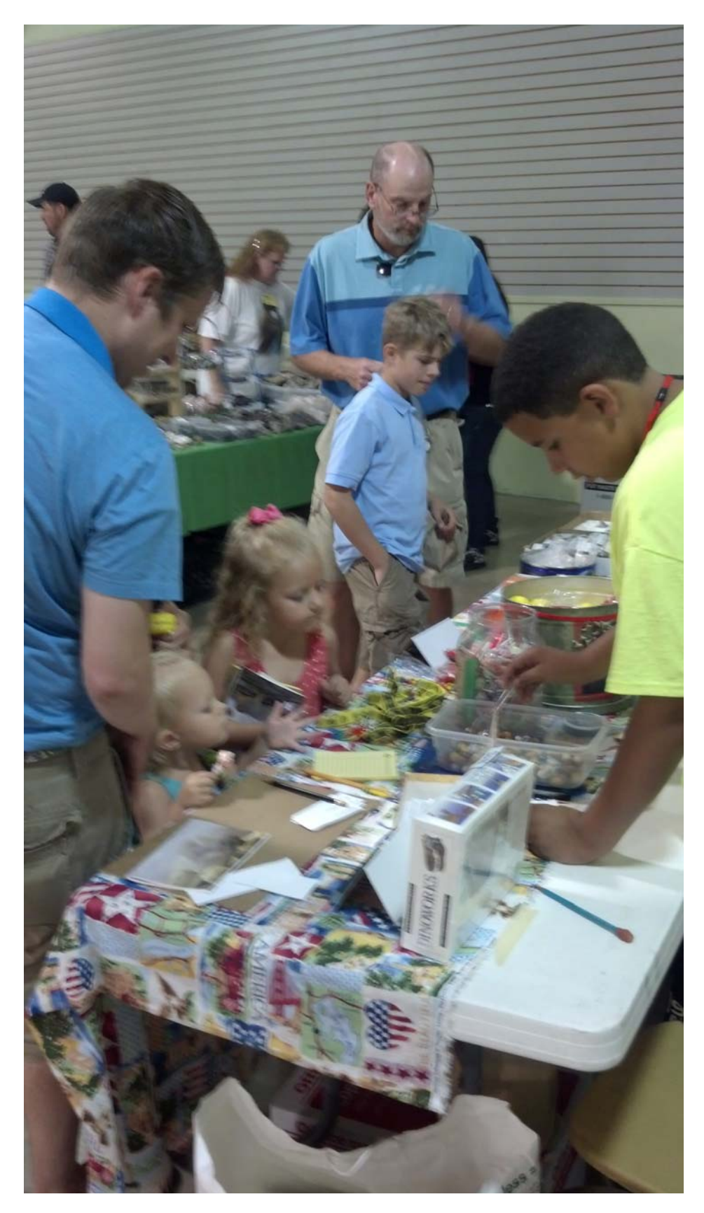
Enjoying the Kids Korner. How many future Rockhounds can you count????