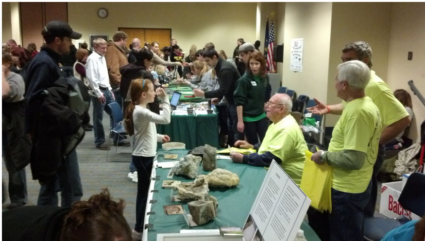
SCIENCE ALIVE !!!